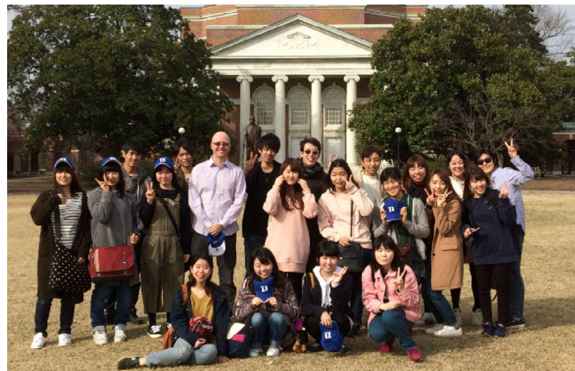
Students enjoying their time at the Duke University campus in Durham

We asked students who went on the Study Trip this year about their impressions and for a message to students who are thinking of joining the next Study Trip in February 2018.