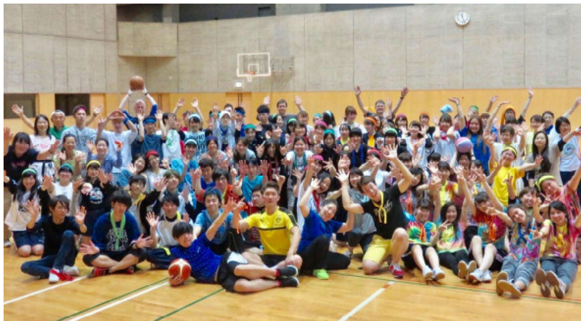
Students and staff pose for a group photo at the end of this year's mixer